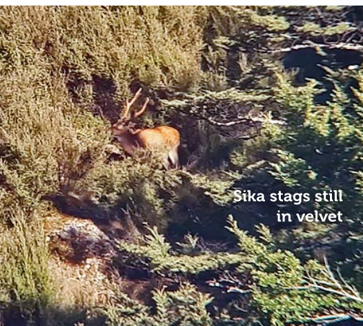
Sika stags still in velvet