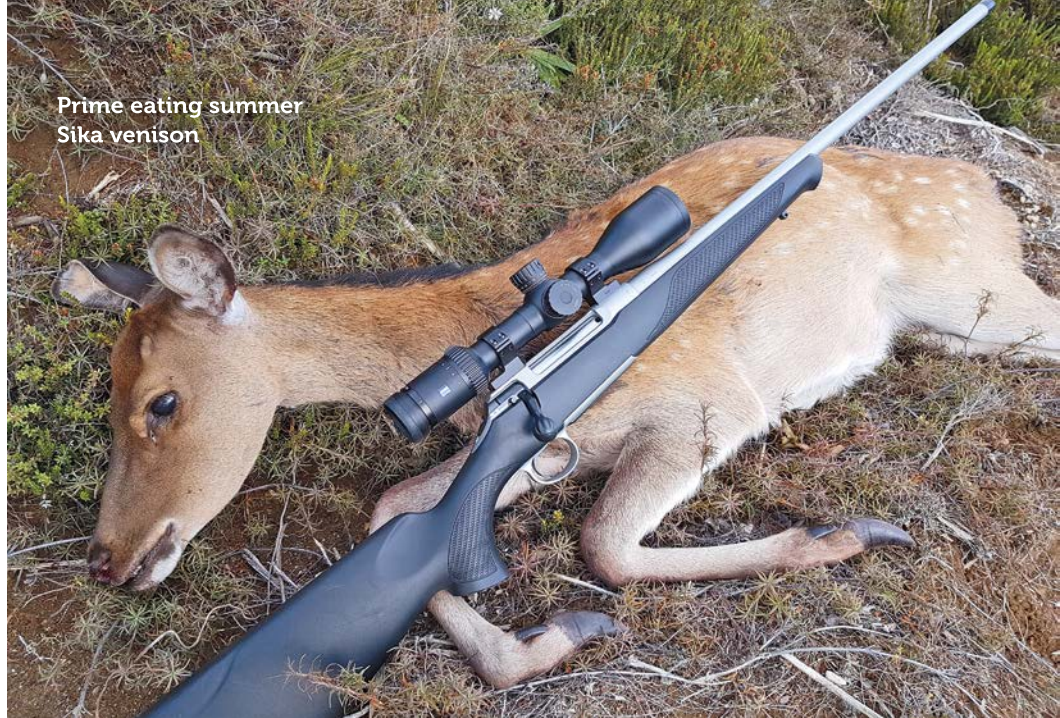
Prime eating summer Sika venison

In the test jig the V6 proved to move true MOA – 10 clicks moved 10.5 inches at 100 yards. There was no noticeable reticle shift throughout the zoom range, and the reticle tracked